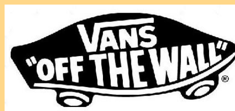
VANS FSN Emergency Needs Program