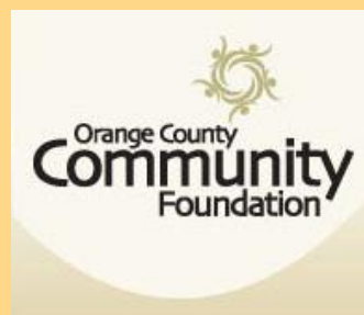
Foundation Orange County Community Foundation I <3 OC Campaign